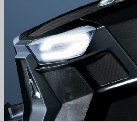
WARRIOR front LED lights and brilliant black finish (7250 TTV/9340 TTV)