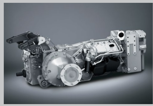
Optimum efficiency: continuously variable TTV transmission for a top speed of up to 60 km/h with a lower engine speed.