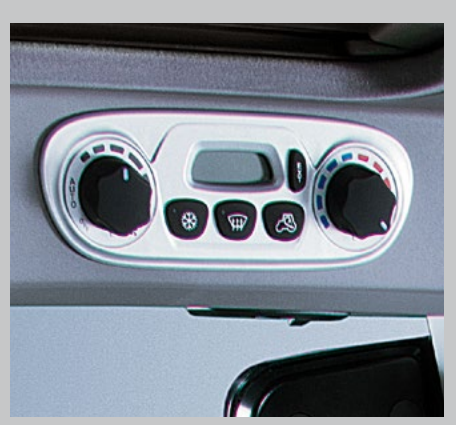
Automatic climate control (7250 TTV/9340 TTV)