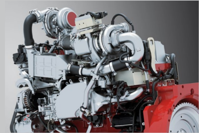
246 hp (181 kW) Deutz engine: immediate response with a high starting torque and significant reserve torque with up to 5% less fuel and AdBlue consumption.