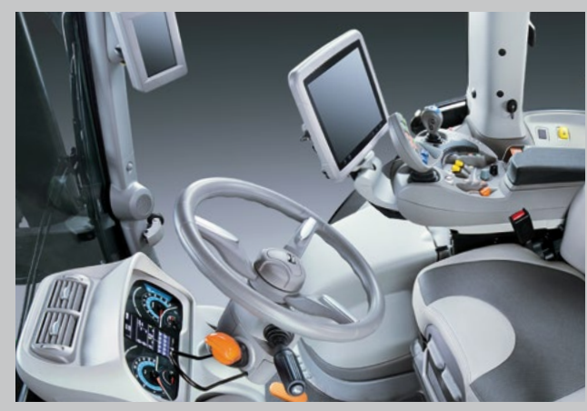
MaxiVision 2 cab with newly designed armrest and 8" or 12" iMonitor. Maximum comfort for maximum driving capacity.

The new 7250 TTV WARRIOR is a special limited-edition model for the toughest jobs on field and road. Its mission is maximum productivity — with a brilliant black finish that reflects brilliant bottom-line figures. This visually striking tractor delivers 246 hp (181 kW) and features a range of trademark German characteristics: Top quality, precision engineering and reliability are all standard equipment. As is the cutting-edge technology that drives down costs while protecting the environment. Innovative and intelligent tractor technology ensures that the 7250 TTV WARRIOR makes the right statement about your professionalism — while you enjoy the exceptional comfort of the MaxiVision 2 cab. Intuitive controls, precision farming systems, innovative axle and brake system concepts, and attachment points for the heaviest equipment combinations round off a truly special edition package. No matter how tough the season gets, the 7250 TTV WARRIOR lets you get even tougher.