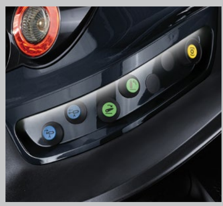
LED lighting for external controls (7250 TTV)