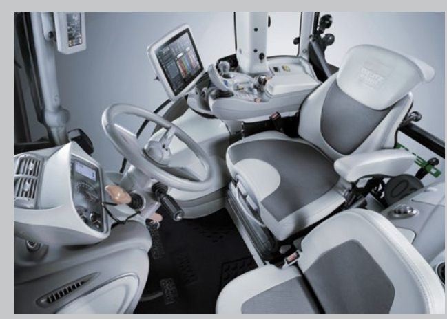
The comfortable MaxiVision 2 cab with iMonitor 2.0, automated routine functions and state-of-the-art precision farming systems. No job is too tough.

model of all time. It enables contractors and farmers to efficiently and effectively tackle even the toughest jobs. One after another. Its mission is superior performance in every situation – both in the field and on the road. The 9340 TTV WARRIOR (336 hp/247 kW) is an ultra-modern, highly intelligent large tractor with supreme operating comfort, automated routine functions and the very latest technology. Every single component is extremely innovative and represents the best option on the market: from the 47,000-lumen work lights, comfortable MaxiVision 2 cab and iMonitor 2.0 to state-of-the-art precision farming systems, a highly efficient Deutz engine with cutting-edge exhaust technology and continuously variable TTV transmission for precise speeds from 0.2 to 60 km/h at reduced engine speed. Additional features include newly developed axle suspension, dry disc brakes, a lifting capacity of 12,000 kg, an electric opening hood and superb design. All of which helps you to finish your work before your work wears you out.