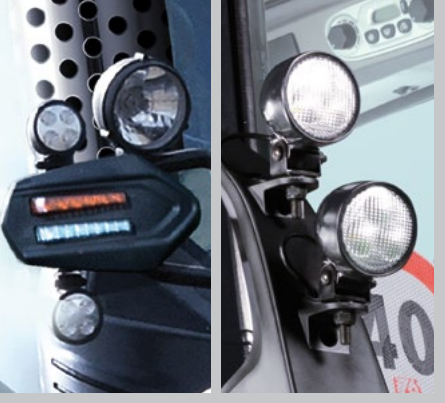
WARRIOR front/rear cab LED lights (7250 TTV/9340 TTV), optional