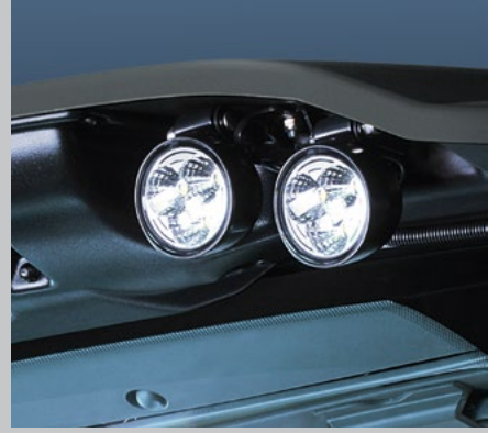
WARRIOR roof LED lights (7250 TTV/9340 TTV) as standard