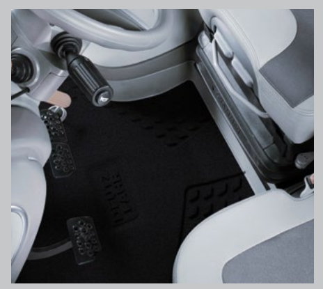
WARRIOR black floor mat (7250 TTV/9340 TTV)