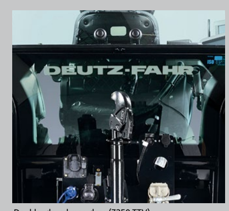
Double-glazed rear glass (7250 TTV)