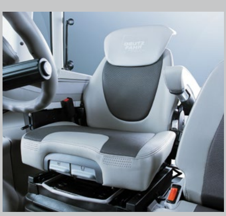
WARRIOR comfort seat (7250 TTV/9340 TTV)