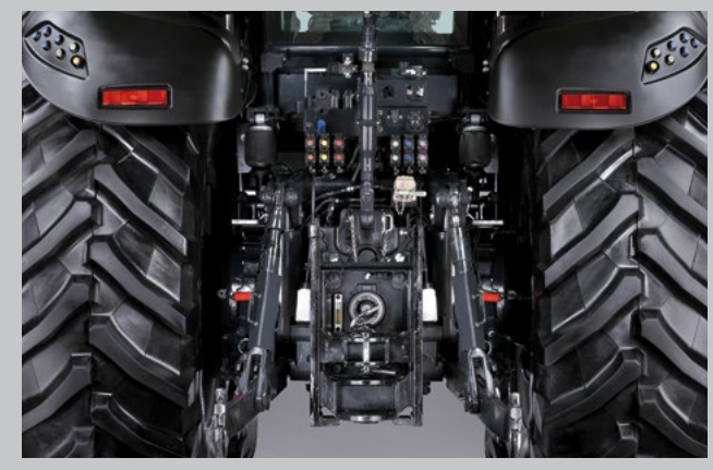
12,000 kg lifting capacity, 210 l/min pump output, three PTO speeds: designed to master any implement.