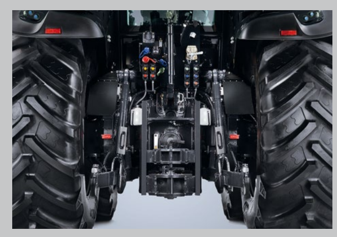
Hydraulic system output of up to 160 l/min, lifting capacity of 10,000 kg and four PTO speeds. Anything is possible.